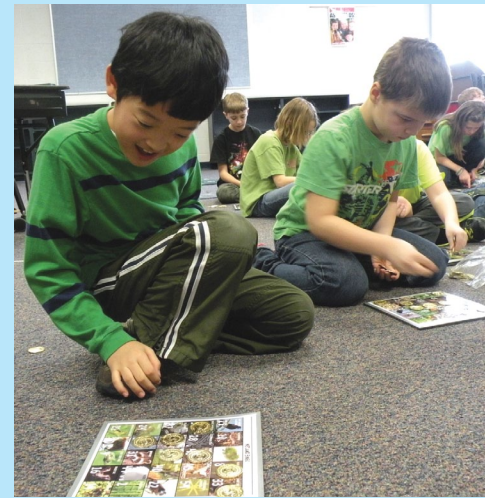
Pictured above: Students play a game of Wetland BINGO. The adoption of indoor modules have made outreach easier in cold winter months.

The adaptation of our education modules for indoor and outdoor use has allowed us to participate in more outreach events in cold weather months, expanding our classroom outreach into February, March, and November.