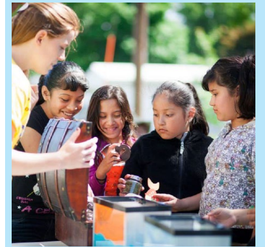
Pictured above: Students try to determine which objects would be found in a clean lake or a dirty lake.