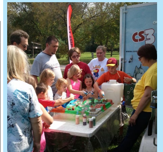
Pictured above: Several families stop by to enjoy a little summer fun with the Enviroscape at the CS3.