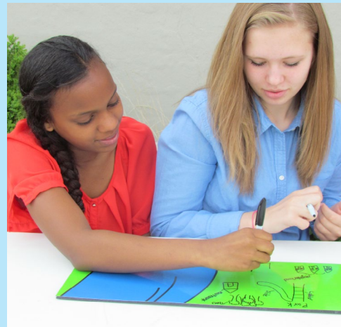
Pictured above: During our watershed module, students are given 5 million dollars to develop a piece of land. Then they must figure out what environmental impact that development will have on the nearby water body. Below: We welcome new members to the Conservation Pack.

The Water Rocks!/ILF team was able to maintain a balance between reaching out to those in big and small communities as well as a good balance between youth and adults. The team took on more youth outreach events in order to meet the demand. This would explain the rise in primarily youth age group events. The high level of engagement is also a product of our ability to provide sound science through fun, educational and interactive means. The creation of new youth modules as well as the fleet of Conservation Station trailers helped achieve the high engagement from participants.