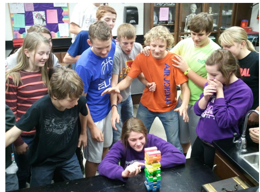
Pictured above: Students play an epic game of Biodiversity Jenga.

Questionnaires with a return envelope were handed to teachers at each classroom event with a return envelope to help see how these individuals perceived our educational programming. We only evaluated the classroom events and not the community events. This allows us to keep track of what is connecting with the students and what needs to be adjusted according to the teachers who evaluate us. In this report we have evaluations from 74 different teachers in 40 different school districts. The results show that the Water Rocks! presentations and outreach are well received and graded highly by Iowa's veteran educators.