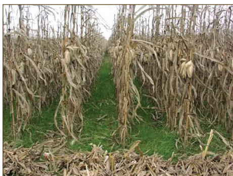
Rye grows between corn rows prior to harvest on the Nelson Family Farm, Fort Dodge.