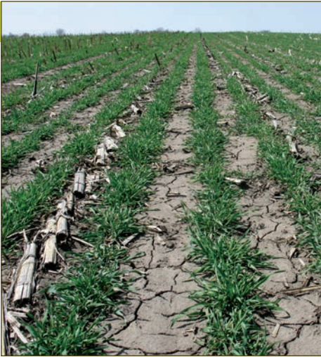
The winter cereal rye cover crop is growing again in the warm spring weather at Rick Juchems' farm near Plainfield, Iowa.

At the remaining 13 site-years, no difference in soybean yield was detected between strips with cover crop and without cover crop.